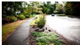
'Hellstrip,' Gardening's Final Frontier