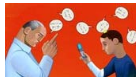
Advice on Giving Advice to 20-Year-Olds