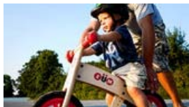
New Bikes Teach Kids to Ride