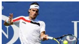
The Flushing Scene