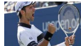
Djokovic Brightens as Light Fades